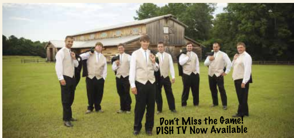
Don't Miss the Game! DISH TV Now Available

Landmark Park is the perfect place for your own special occasion. Weddings, proms, parties, family reunions and more have been held at our Stokes Activity Barn. With 8,000 square feet, the barn has plenty of space. Our new bridal suite is perfect for getting ready for your big day. Call 334-794-3452, email laurav@landmarkparkdothan.com or visit www.landmarkparkdothan.com for details.