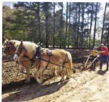
1890s Living history farm

Corporate Members may elect to receive additional one-time guest passes in lieu of family memberships. One membership is equal to 15 passes. Landmark Park is a 501(c)3 nonprofit. Fifty percent of your membership fee is tax deductible if benefits are received. If benefits are declined, 100 percent of your membership is tax deductible.