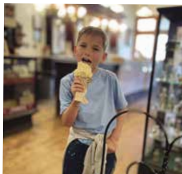
Historic soda fountain and town square