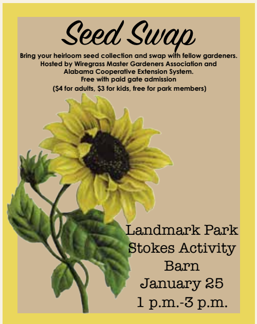
Sponsored by Wiregrass RC&D