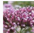
Tuberos Vervain ( Verbena rigida )

Considered an invasive plant that was brought from Europe for cattle feed, this member of the clover family has a striking red floret that is a common sight along our roadways during this time of year.