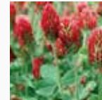
Crimson Clover ( Trifolium incarnatum )

This evergreen vine is the harbinger of spring-typically the first flower to bloom after winter, and is observed in the highest reaches of the trees. Being a false jasmine, every part is poisonous, so don't let its honeysuckle-like appearance fool you!