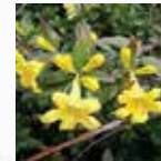
Yellow Jasmine ( Gelsemium sempervirens )

It is almost unbelievable that something so astoundingly beautiful is absolutely organic and natural- a free perk of living in this great state. So why observe from afar, through the barrier of our car windows, when we can admire Alabama's wildflowers up close, learning to properly identify these colorful natural wonders?