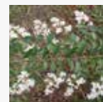
Chinese Privet ( Ligustrum sinense )

Originally from South America, the vivid purple of these flowers is hard to miss on our roadsides. Butterflies and hummingbirds frequent this hardy ground shrub with a rough, abrasive stem and leaves.